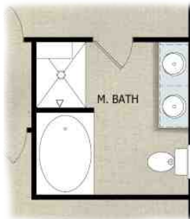
Traditional Master Bath